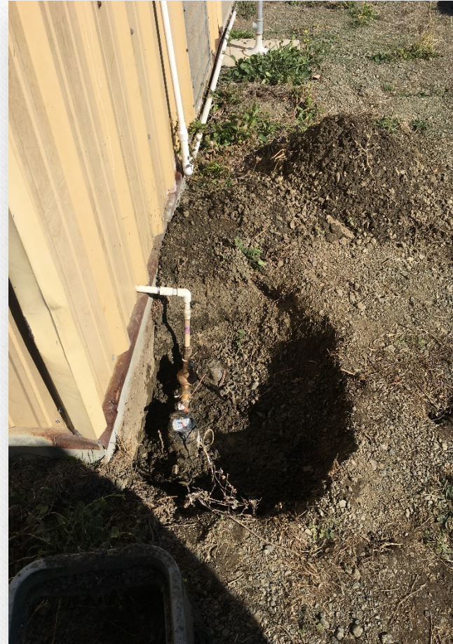
This pressure regulator is located at SS3. The water that goes through the regulator is for the chlorine analyzer and the turbidimeter for the entire SS wellfield.